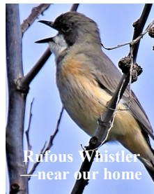
Rufous Whistler —near our home